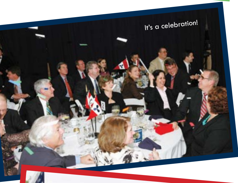
It's a celebration!

Proceeds from the dinner support the Maritime College Scholarship Fund. The 2009 Admiral's Scholarship Dinner raised more than $430,000.