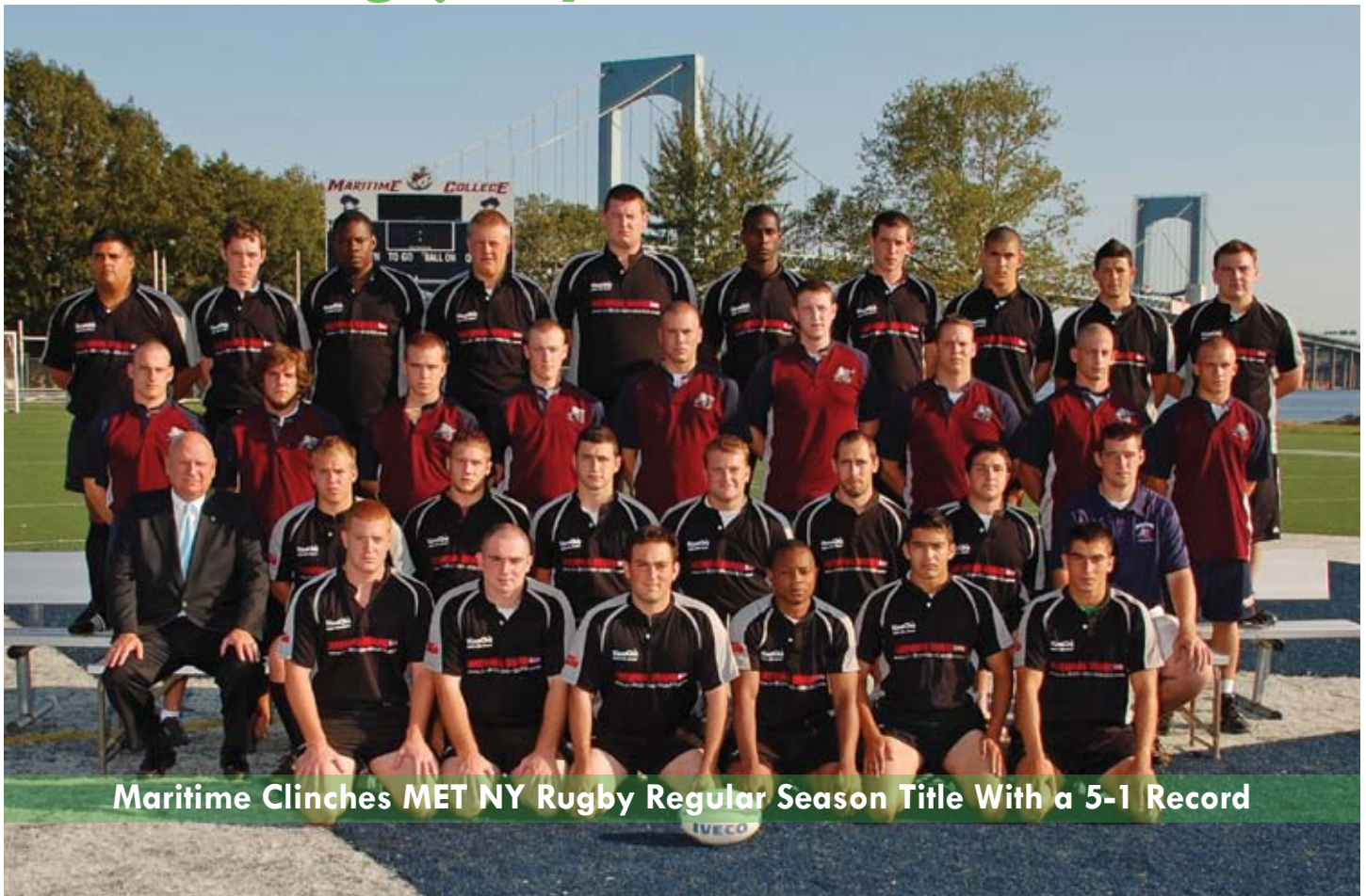
Maritime Clinches MET NY Rugby Regular Season Title With a 5-1 Record