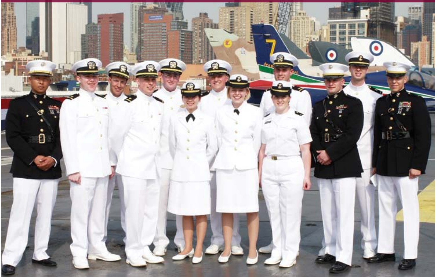
Newly commissioned officers onboard the Intrepid

I t was a very good year for the Naval Reserve Officer Training Corps (NROTC) Unit at SUNY Maritime College! In September, the NROTC Battalion welcomed 60 new Midshipmen and Officer Candidates into its ranks. The students endured a rigorous eight-week indoctrination period before formally joining the Battalion in late October. With the NROTC Battalion's newest members, the Battalion grew to over 215 NROTC and Merchant Marine Reservists (MMR), making it one of the largest NROTC units in the country.