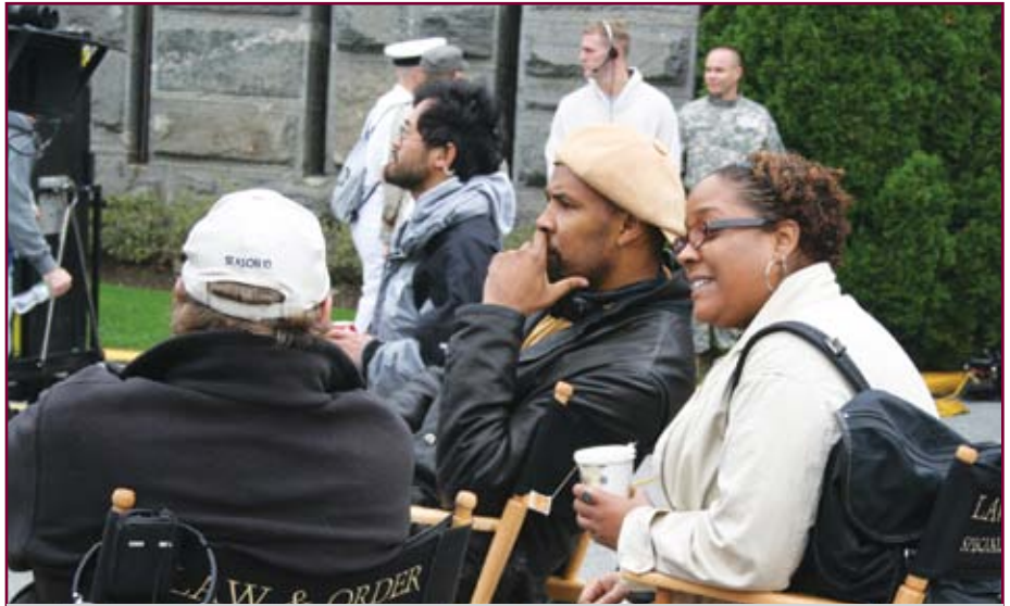
Law & Order: SVU director Eriq LaSalle and show producers on set at Maritime in the Fall, 2008

This spring, the Empire State VI was again called into action when the deck of the ship became the stage for an on-location, one-day television shoot for A&E's Celebrity Ghost Stories . Producers are planning to air the show in late October, 2009.