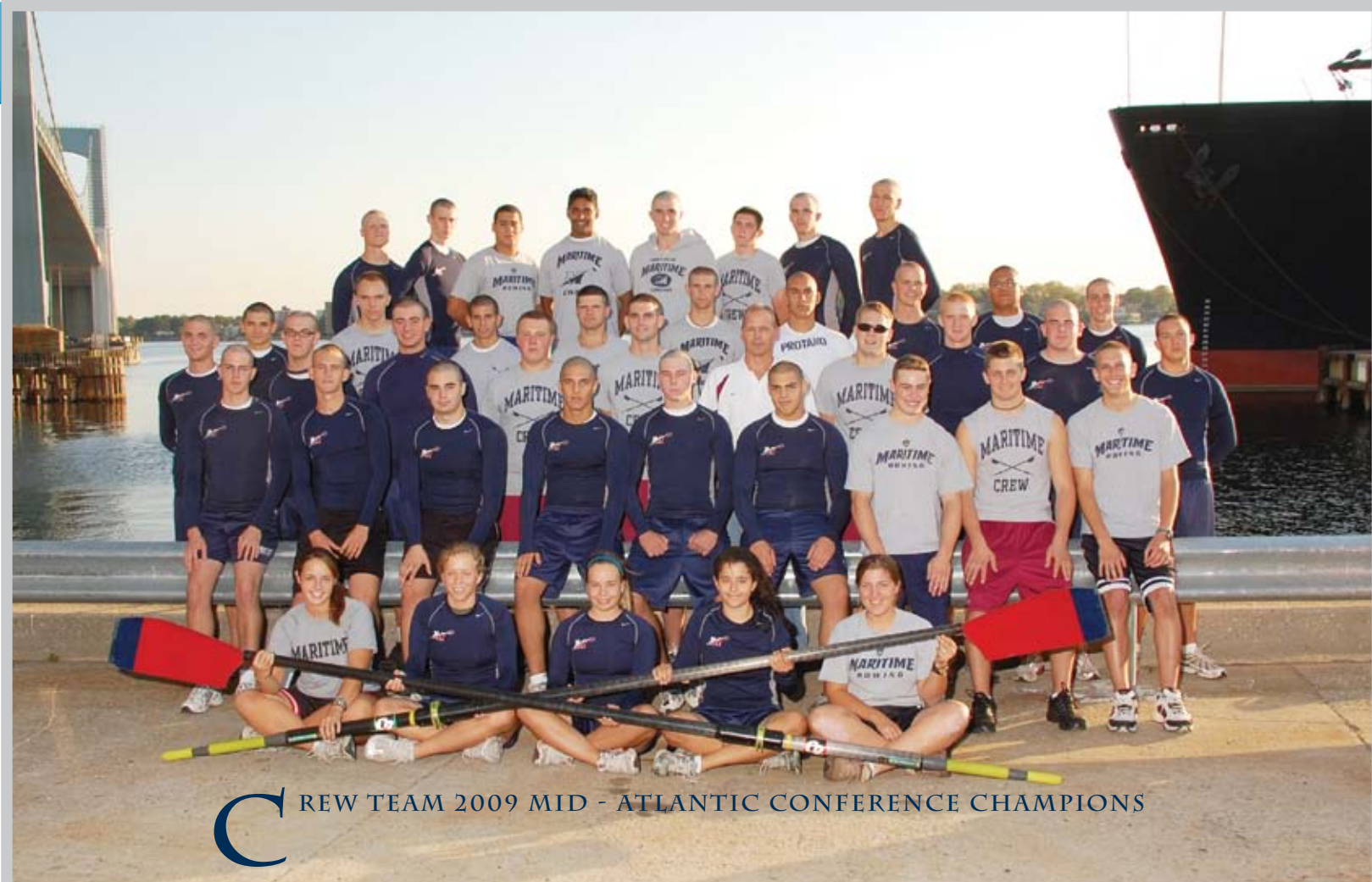
C REW TEAM 2009 MID - ATLANTIC CONFERENCE CHAMPIONS