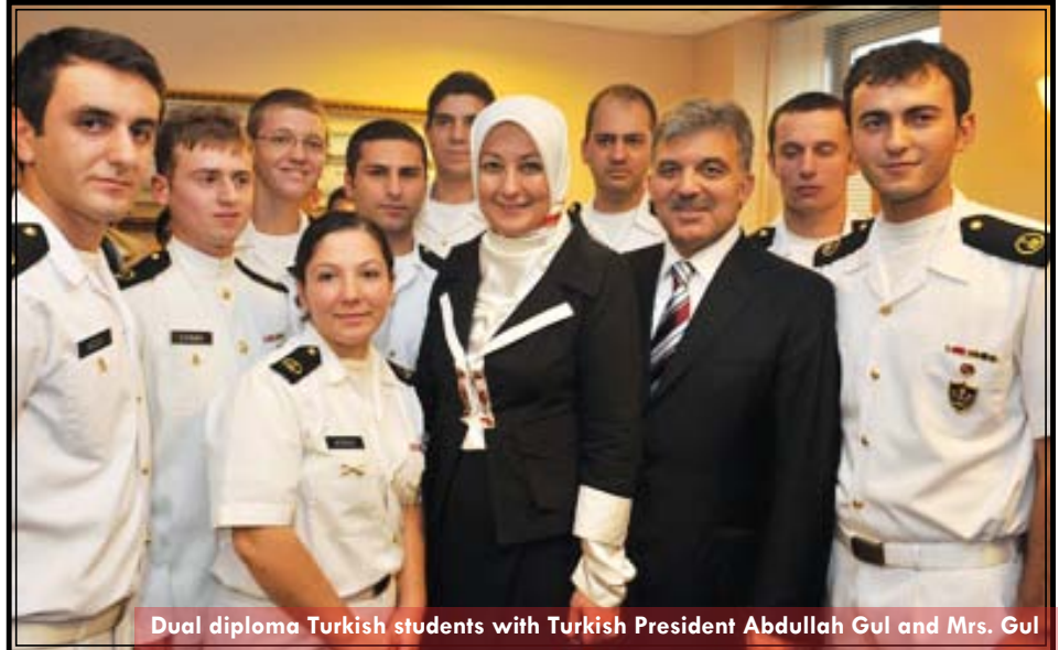
Dual diploma Turkish students with Turkish President Abdullah Gul and Mrs. Gul