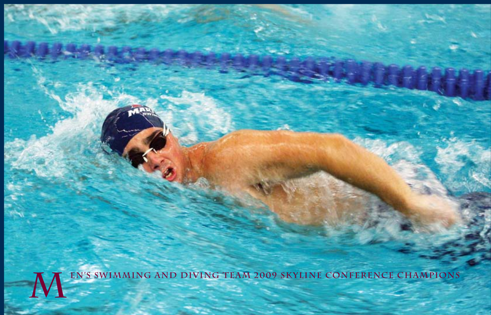
M EN'S SWIMMING AND DIVING TEAM 2009 SKYLINE CONFERENCE CHAMPIONS