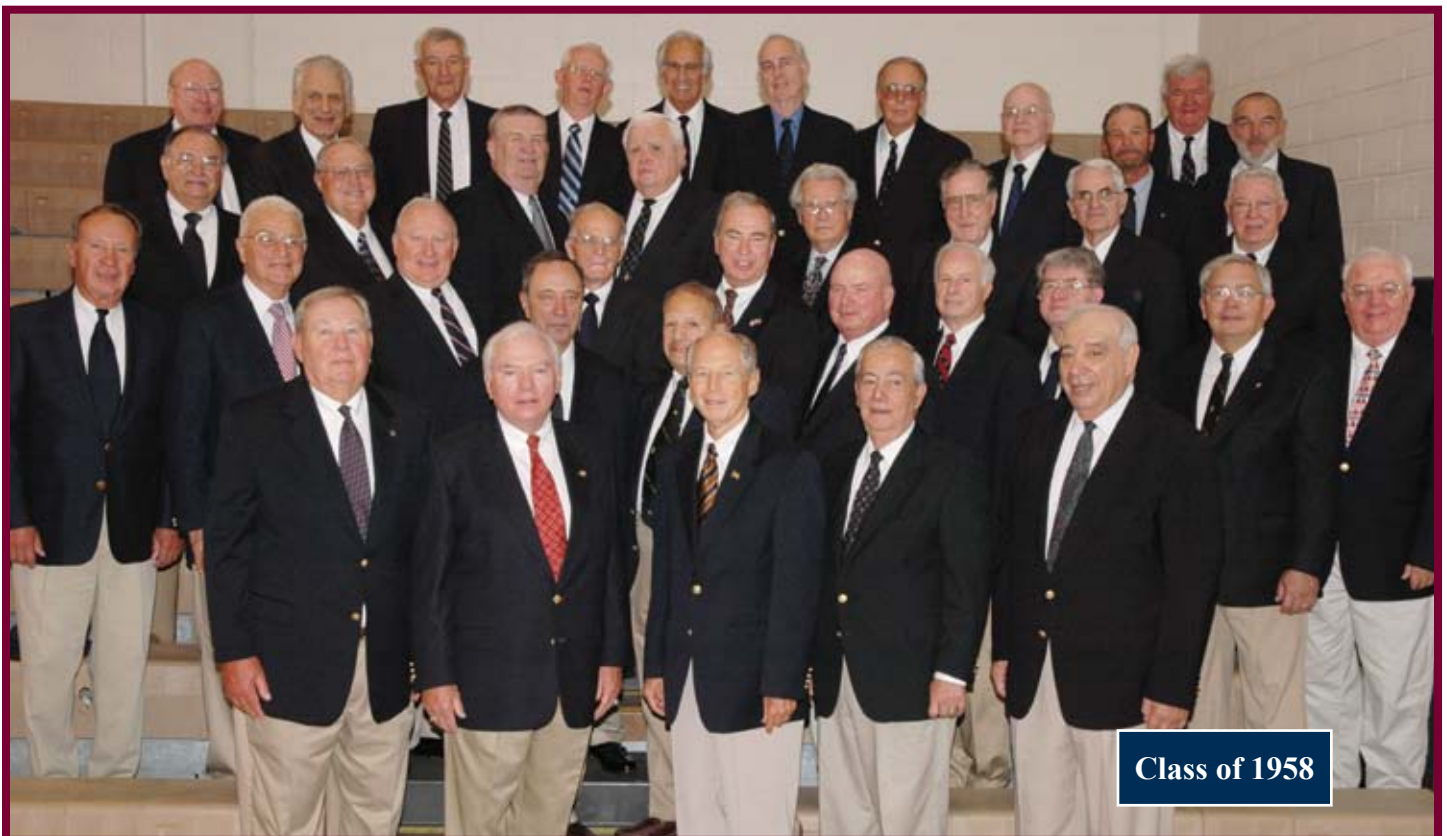
Class of 1958

Later that afternoon, before a packed stadium filled with alumni, the Privateers played an exciting football game against Norwich University and won the game 34-20. The day continued with more sporting events and informal meetings among old friends.